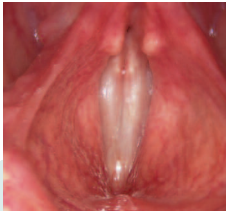
Normal vocal folds voicing