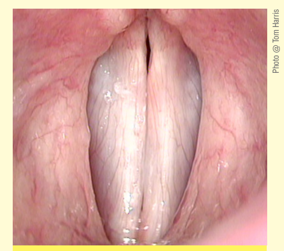
Normal vocal folds - closed

Our voices as well as our bodies also alter with time. The most obvious change occurs when the voice breaks in boys at puberty, but there is also a gradual decrease in pitch in both sexes until middle age. During middle age, women particularly notice a drop in vocal pitch, especially after menopause, while men in late middle age may begin to notice a rise in vocal pitch. These changes occur in response to the way ageing affects the larynx and the structure of the vocal folds (cords):