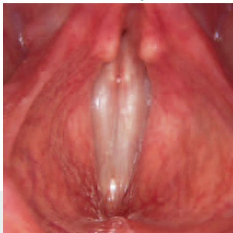
Normal vocal folds voicing